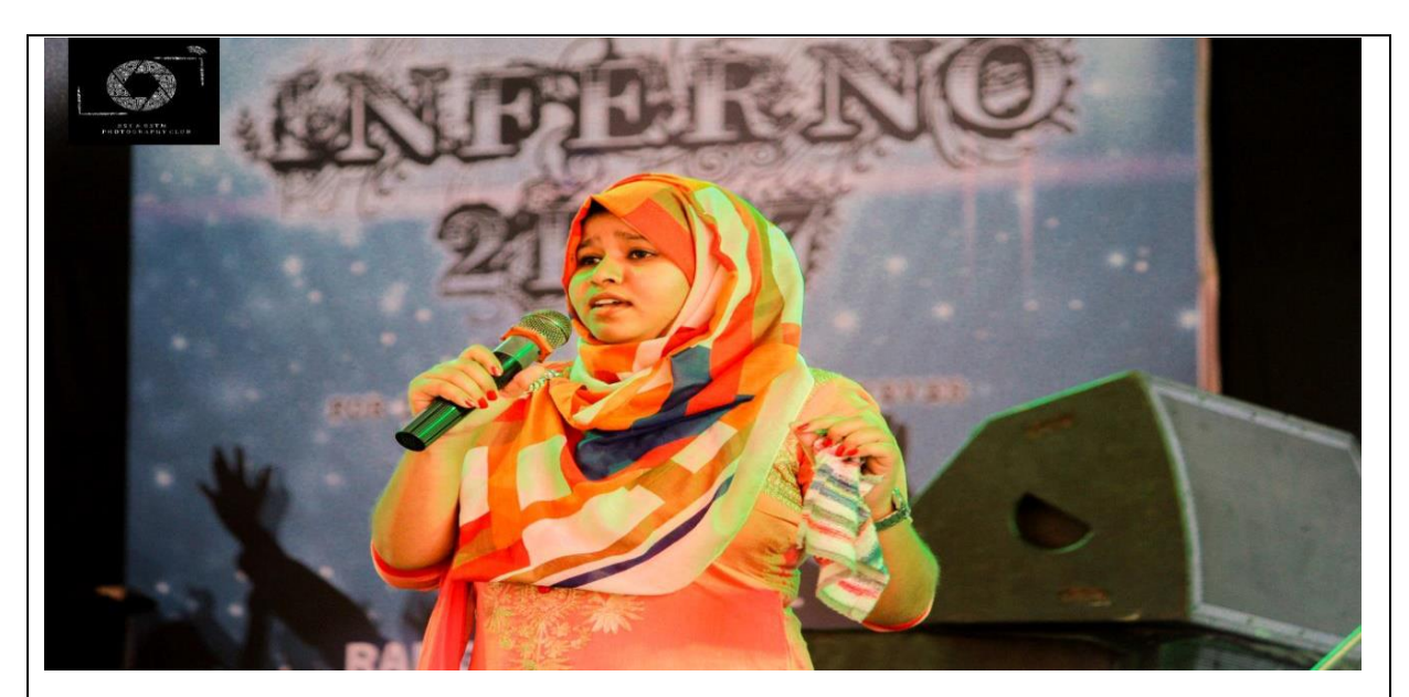
CELEBRATION OF INFERNO