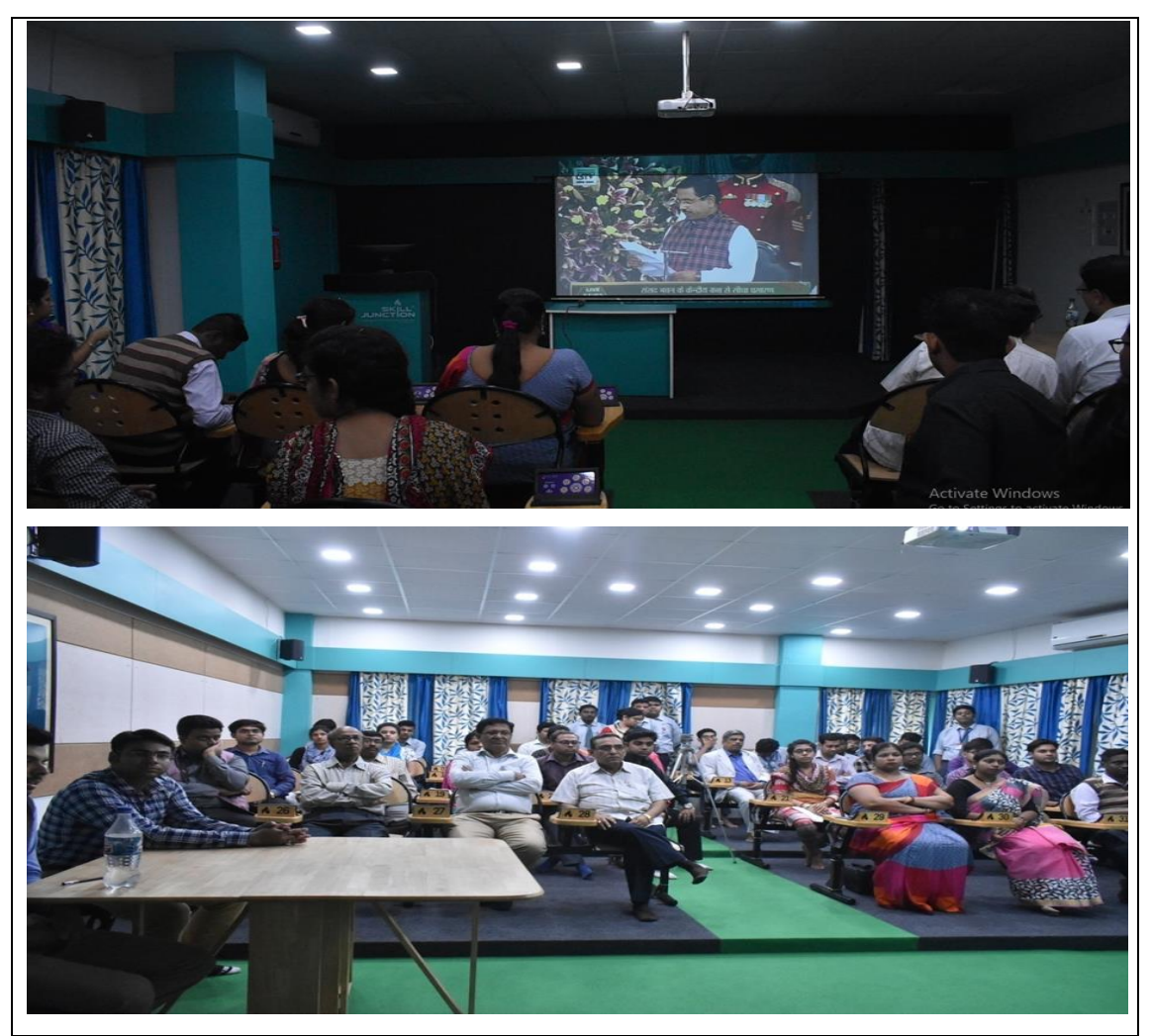
CELEBRATION OF THE INDIAN CONSTITUTION DAY