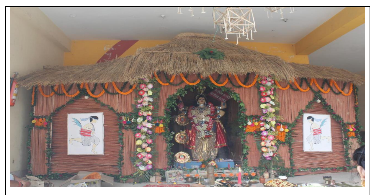
CELEBRATION OF VISHWAKARMA PUJO